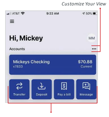
Quick Action Buttons