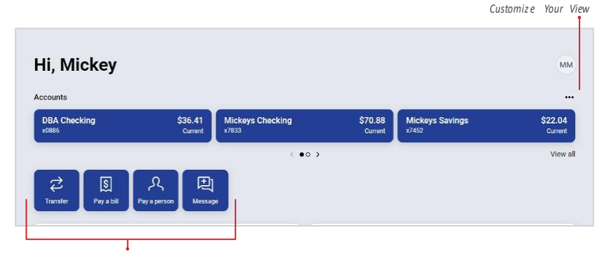
Quick Action Buttons